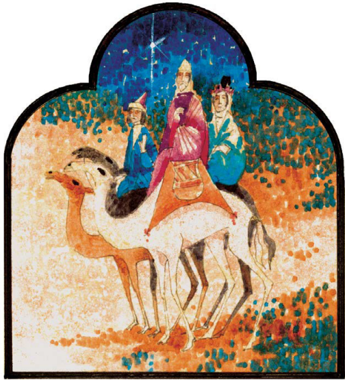
Magi from the east arrived